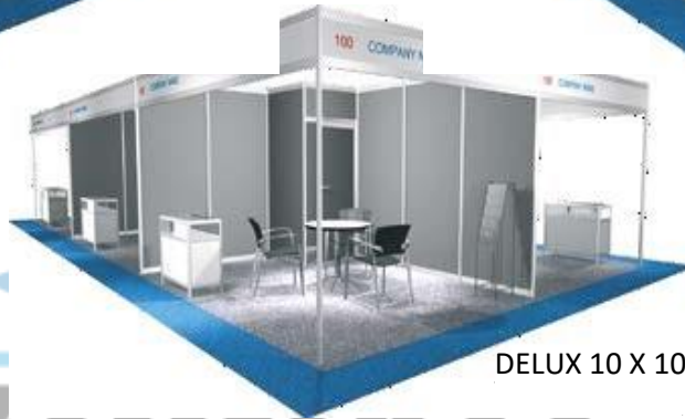
DELUX 10 X 10 M