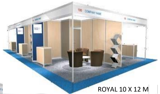
ROYAL 10 X 12 M