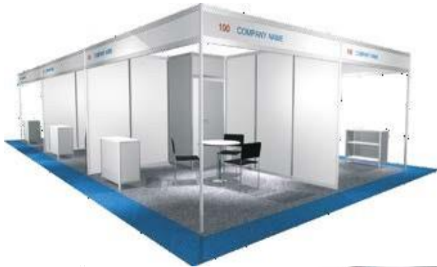
STANDAR 5 X 5 M